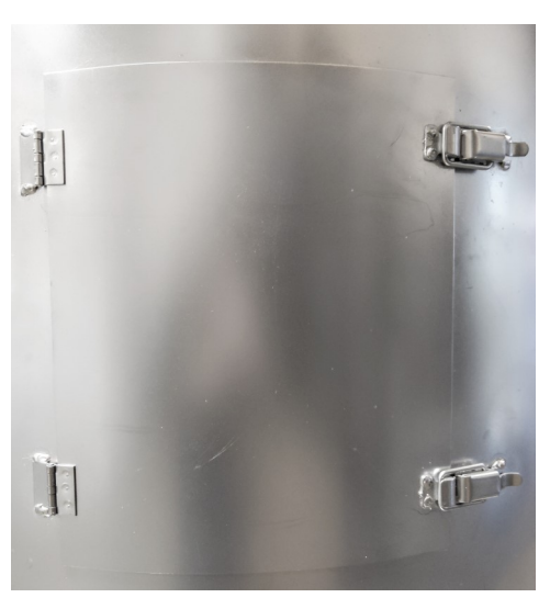
Double Latch Clean-Out Door